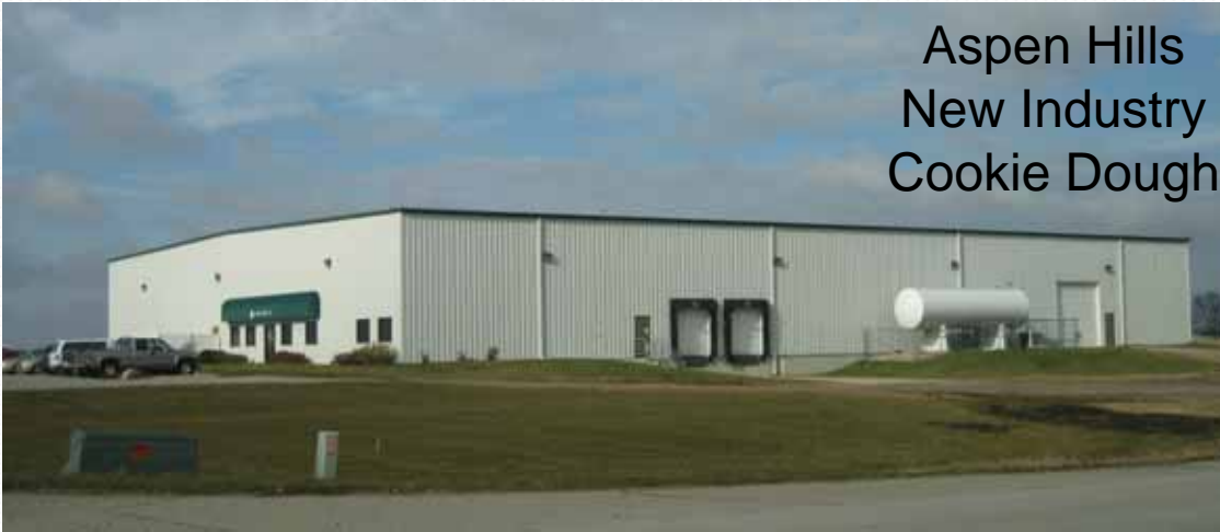
Aspen Hills New Industry Cookie Dough