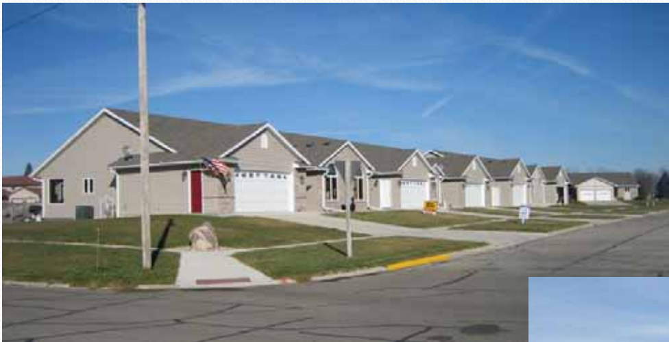
Fairway View Estates 5 New Condos