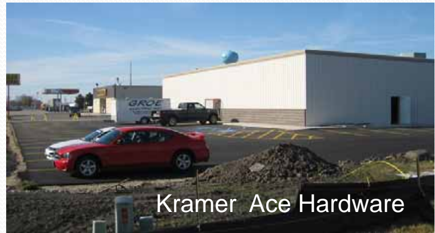
Kramer Ace Hardware