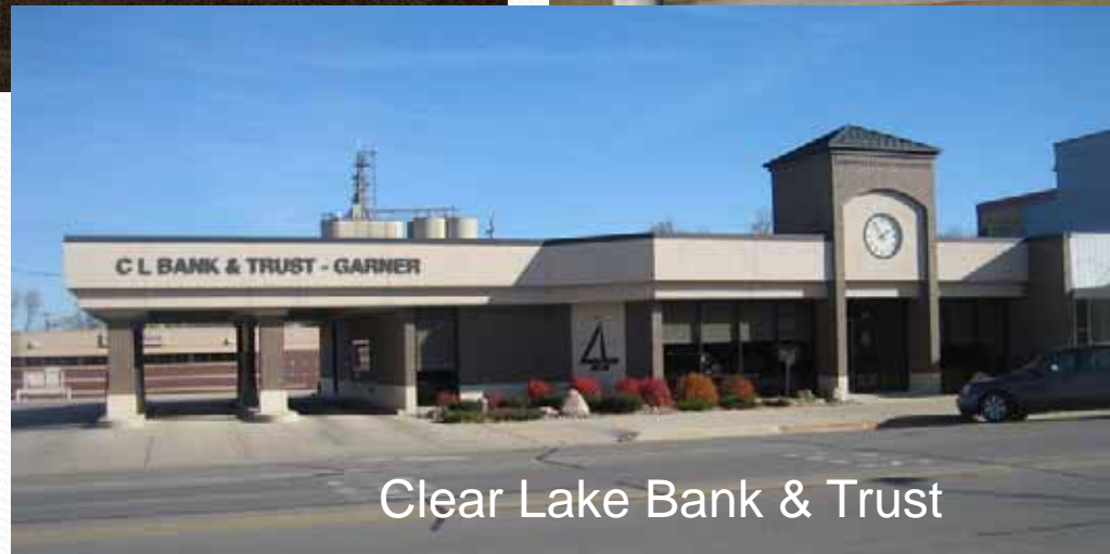
Clear Lake Bank & Trust