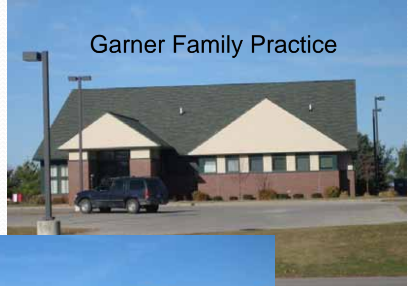
Garner Family Practice