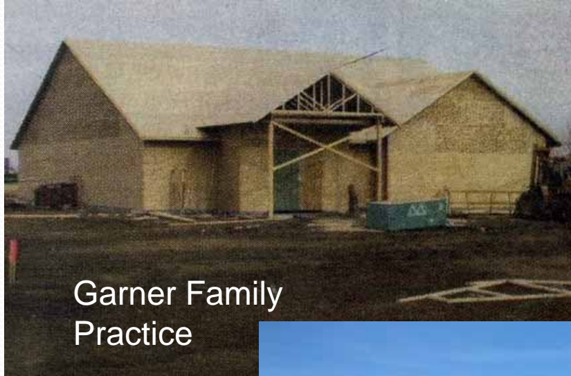
Garner Family Practice