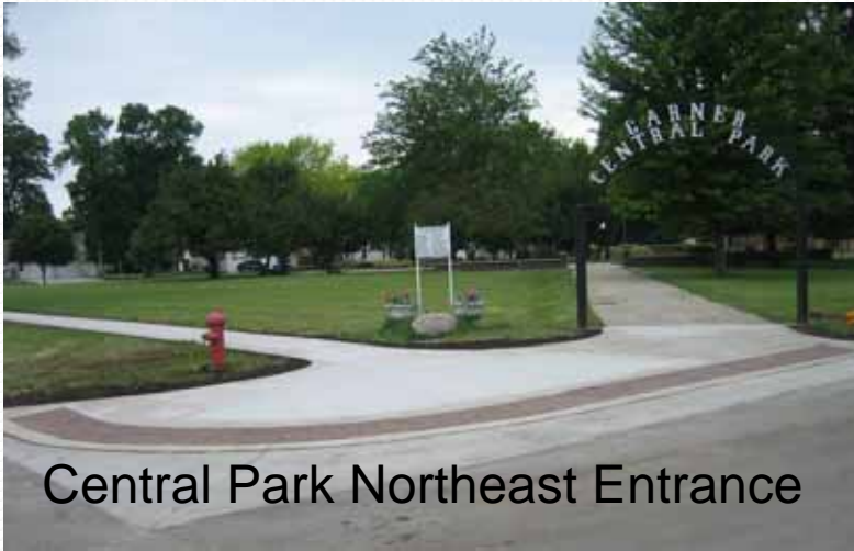
Central Park Northeast Entrance