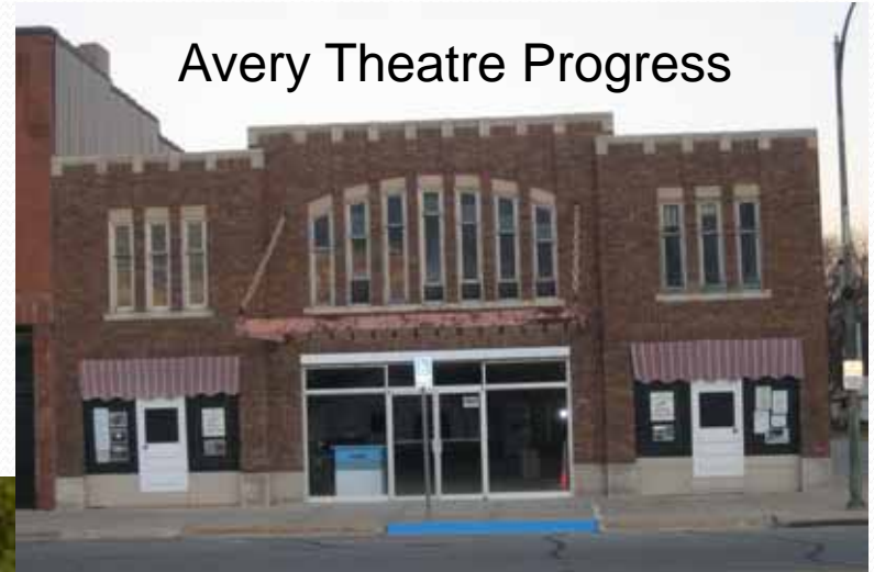
Avery Theatre Progress