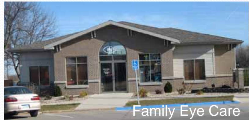
Family Eye Care