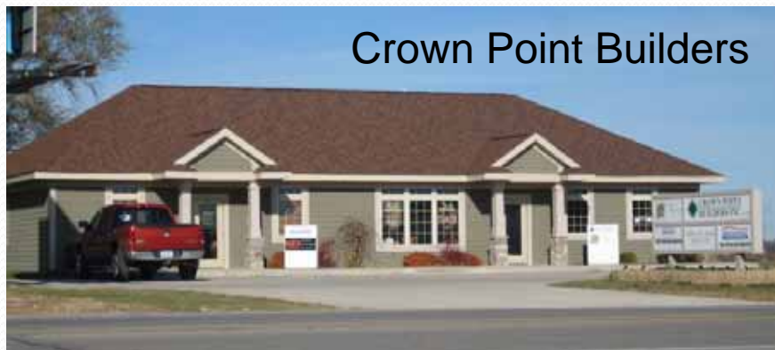
Crown Point Builders