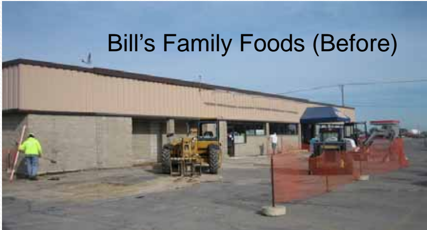
Bill's Family Foods (Before)