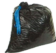
Garbage or Yard Debris