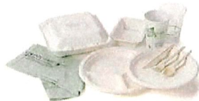
Compostable Cups, Plates, Utensils & Bags