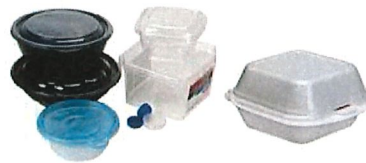
Plastic & Styrofoam Food Containers, Lids & Loose Caps