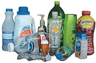
Screw-Top Plastics (with caps) & ONLY Yogurt & Margarine Tubs (no lids)