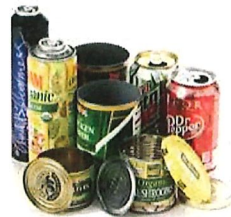
Aluminum, Tin & Empty Aerosol Cans