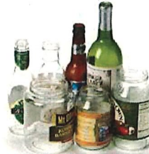
Glass Jars & Bottles (All colors)