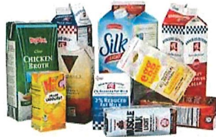
Paper Food Cartons (no caps) (not cylinder shaped)