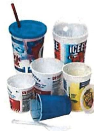
Plastic Cups & Tubs, Lids & Utensils