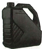
Containers for Hazardous Materials