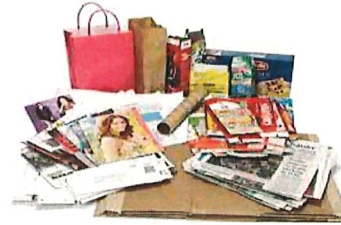
Newspaper, Glossy Inserts & Magazines Mixed Paper (Junk mail, phone books, envelopes) Cardboard (Break down and cut to fit into cart)