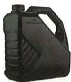
Containers for Hazardous Materials