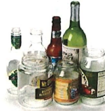
Glass Jars & Bottles (All colors)