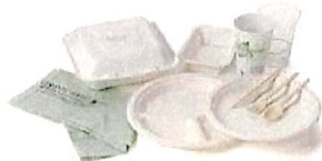
Compostable Cups, Plates, Utensils & Bags