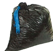
Garbage or Yard Debris