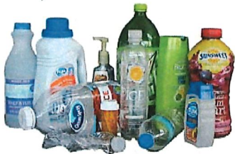
Screw-Top Plastics (with caps) & ONLY Yogurt & Margarine Tubs (no lids)