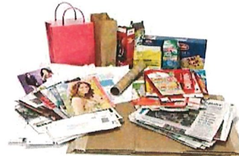
Newspaper, Glossy Inserts & Magazines Mixed Paper (Junk mail, phone books, envelopes) Cardboard (Break down and cut to fit into cart)