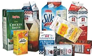
Paper Food Cartons (no caps) (not cylinder shaped)