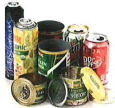
Aluminum, Tin & Empty Aerosol Cans