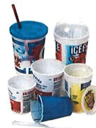
Plastic Cups & Tubs, Lids & Utensils