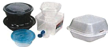
Plastic & Styrofoam Food Containers, Lids & Loose Caps